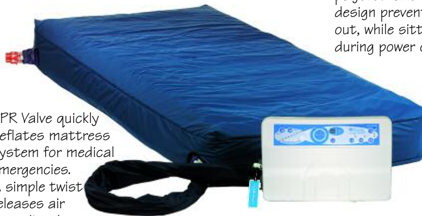
Model 9500 Mattress & Pump System

Hose connections feature a transport locking device that ensures the mattress remains inflated for patient transport.