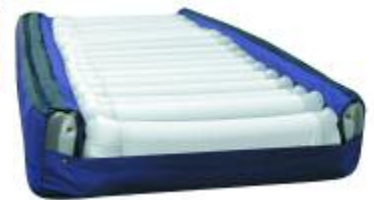
Power Pro® VW Expandable Mattress System

The blower pump is controlled by a micro-processor which allows the caregiver total control of comfort and chosen therapy. Cycle time ranges from 5 to 95 minutes. The blower pump inflates the mattress within minutes, reducing the waiting time for therapeutic treatment to begin. Optional pulsating low air loss pump Model 9511-PS allows caregivers to provide pulsating low air loss therapy.