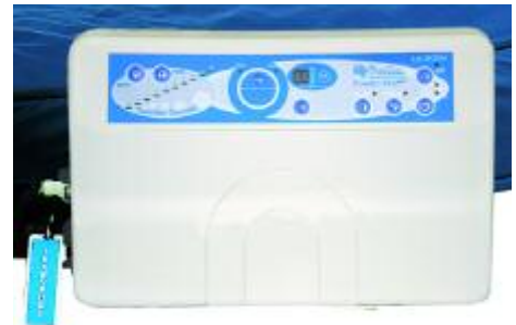
Model 9511 Pump only