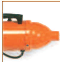
Electric Inflator #9623