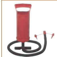
Manual Inflator #5301