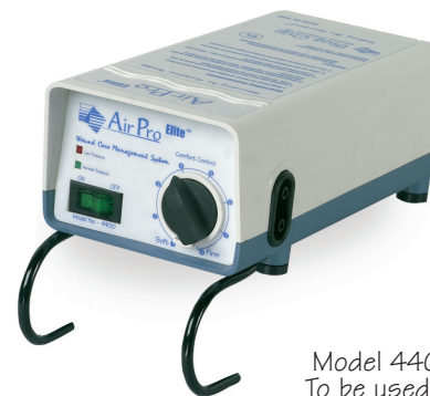
Model 4401SS To be used with Laser & Multi pad only