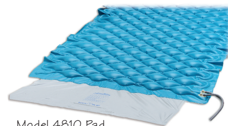
Model 4810 Pad with flaps