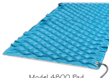
Model 4800 Pad without flaps

Design: Bubble Style with more touch points for effective pressure redistribution.