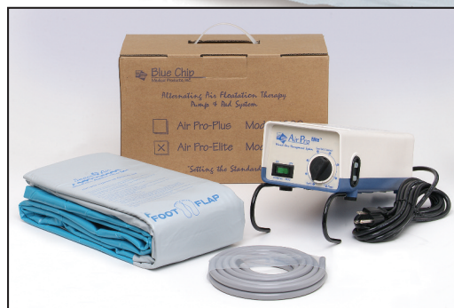
Model 4400 system shown