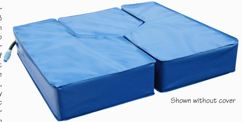
Shown without cover

The GRZ is dynamic adjustable air bladder system consisting of 3 individual air cell chambers which redistribute pressure and adjust to body weight and position. Ideal for patients with moderate to high risk of skin breakdown who require significant postural support. The GRZ allows the therapist to offer correct posture, proper alignment and trunk stability as well as adjustments for pelvic obliquities. Does not require pump for adjustment. Adjustable strap secures cushion to wheelchair.