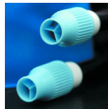
Self Adjusting Air Valve