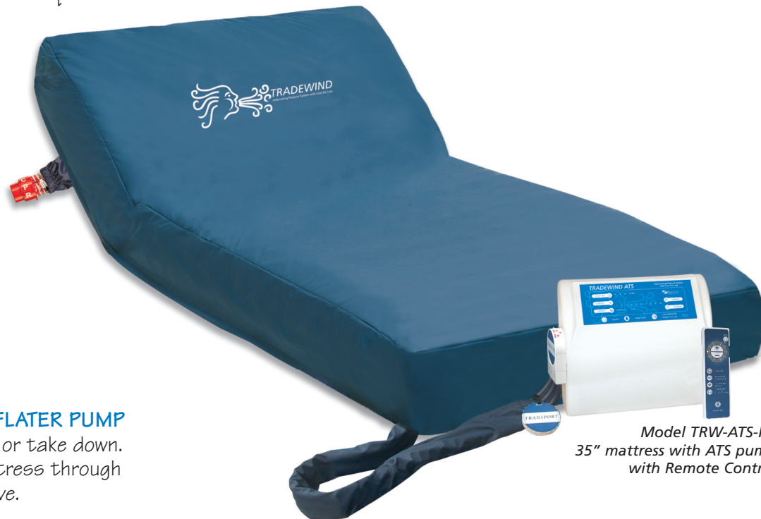
Model TRW-ATS-RC 35" mattress with ATS pump with Remote Control